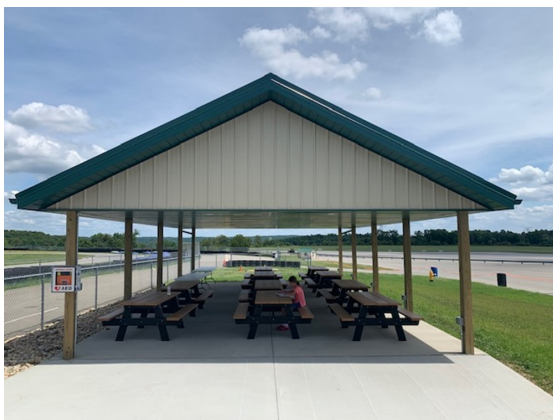
Pitt Race Karting Track Pavilion